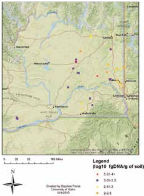
R. solani DNA concentration in soil