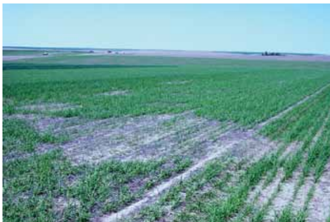
Figure 1. Rhizoctonia bare patches in spring wheat, Ritzville, Washington.

How can growers manage this disease? They have two sets of tools in the toolbox—cultural and chemical. For cultural control, reduction of the green bridge is essential, especially for spring wheat. Rhizoctonia and other soilborne pathogens also grow on