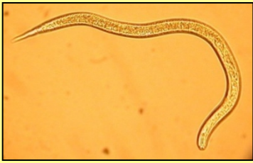
2 nd stage juveniles emerge from cyst & migrate through the soil in the spring (some are released the 1 st year and others over several years)