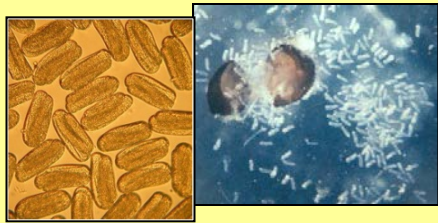
when crushed, a brown cyst is shown to contain up to 600 eggs + juveniles