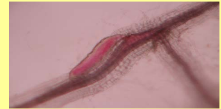
inflated 3 rd stage female becomes embedded in roots of very small seedlings