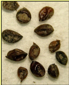
egg-filled brown cysts are freely disburshed into the soil & survive for many years