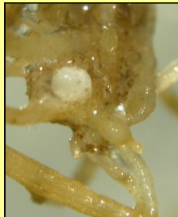
egg-filled swollen white female at time of wheat anthesis (≈1/32" diam.)