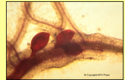
swollen 4 th stage females embedded in roots