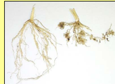
roots become knotted & shallow